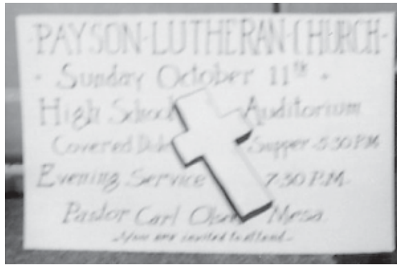
Poster from October 1959