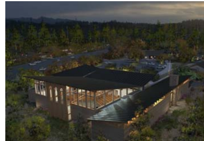
Aerial View Campus

Let your giving be with JOY & CELEBTATION