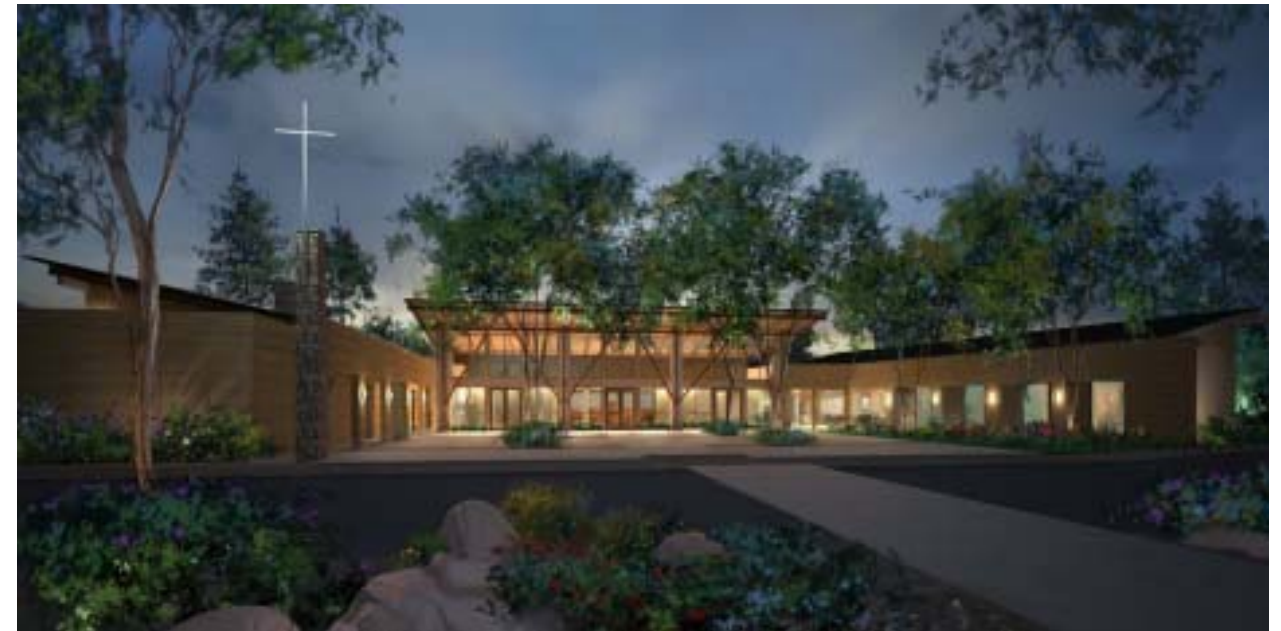
Artist Rendering campus