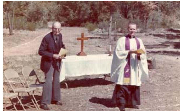
Groundbreaking Service June 1976